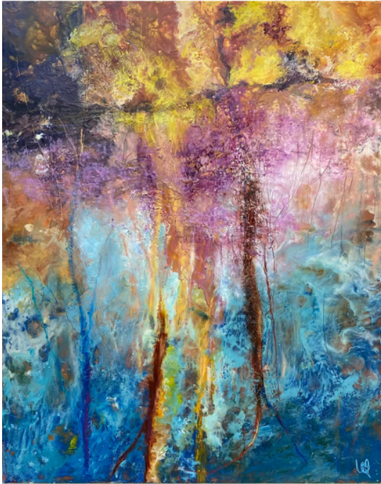
Reflections 4.13.21 Mixed Media/Canvas 64 x 48"